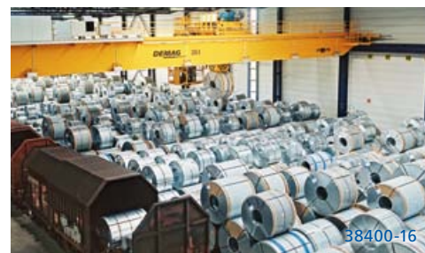
Just-in-time delivery to an automotive plant by Panopa in Wolfsburg, Germany