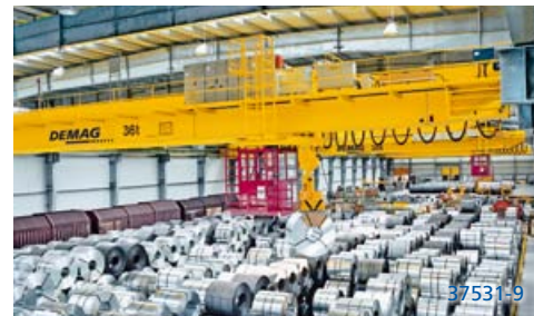
Coil handling and processing at Welser in Ybbsitz, Austria