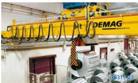
Automatic handling of aluminium coils at Pechiney Rhenalu in Rugles, France