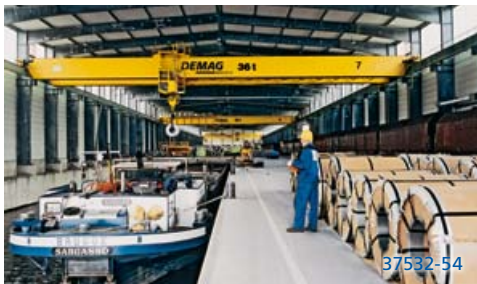
Goods being loaded and unloaded on ships, rail and trucks at ILL in Linz, Austria